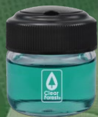
To place in the car