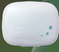
Under Seat Side Pocket Type